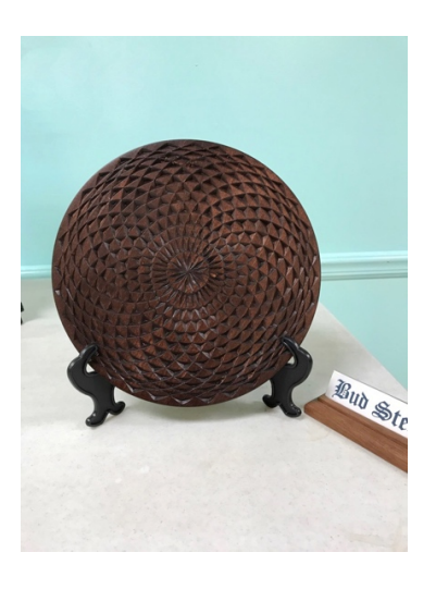
Bud Stevens Chip Carved Sphere